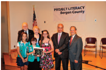
Girl Scout Troop 498

Project Literacy of Greater Bergen County would like to thank the following companies, agencies and individuals for their ongoing financial support: