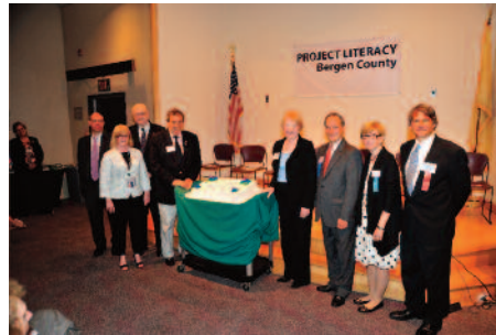
Celebrating 25 Years!