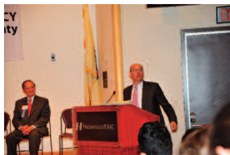
FTC Chairman Jon Leibowitz