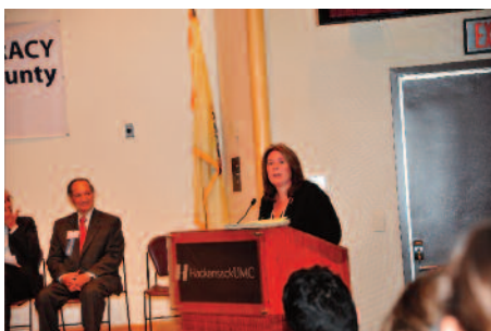
Assemblywoman Holly Schepisi